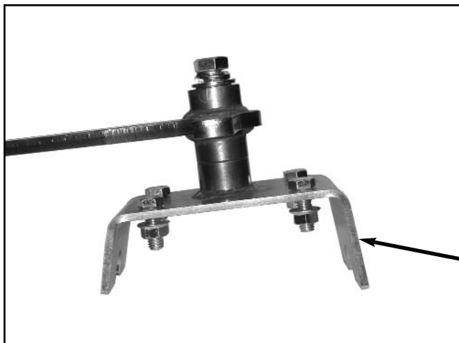
Cut to any angle and weld on.

MASTER POWER BRAKES TECH-LINE# 888-533-1199