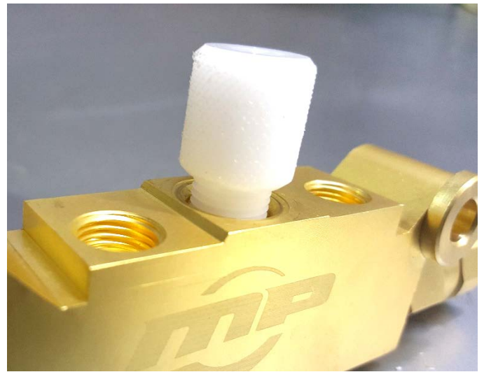
Figure 1b – Tool Installed in the Combination Valve