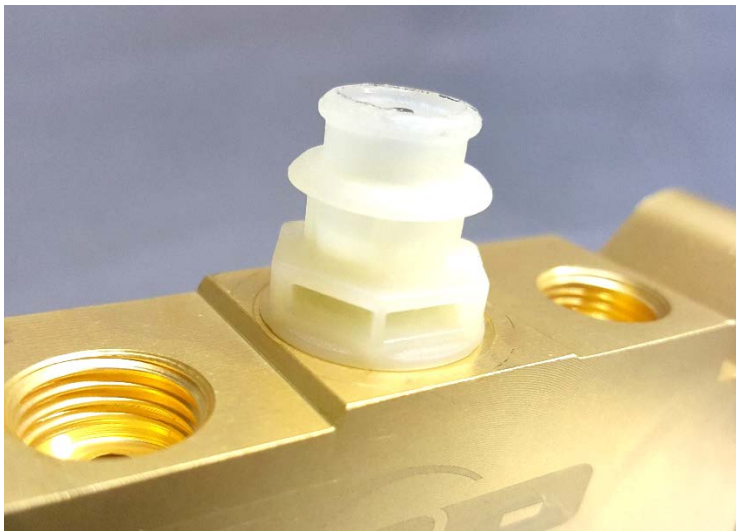
Figure 1a – Switch Installed in the Combination Valve